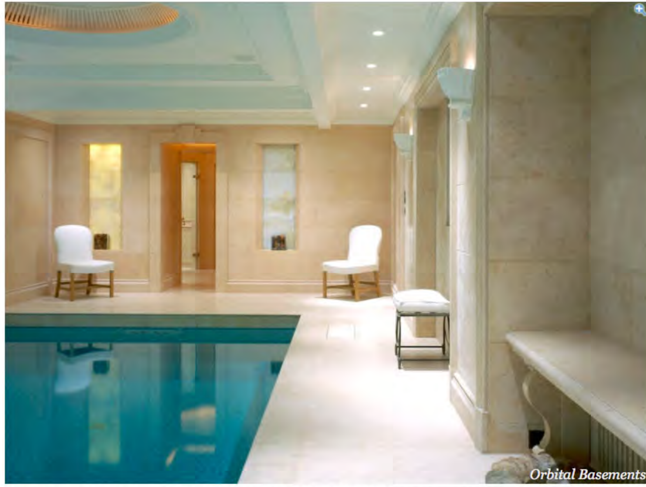
Swimming pools have become a standard fixture in basements for the the uber-wealthy.

While a single basement level is enough for some, others have multi-level basements that stretch as far as five floors underground. These "iceberg basements" are so-called because such large portions of the house sit underground.