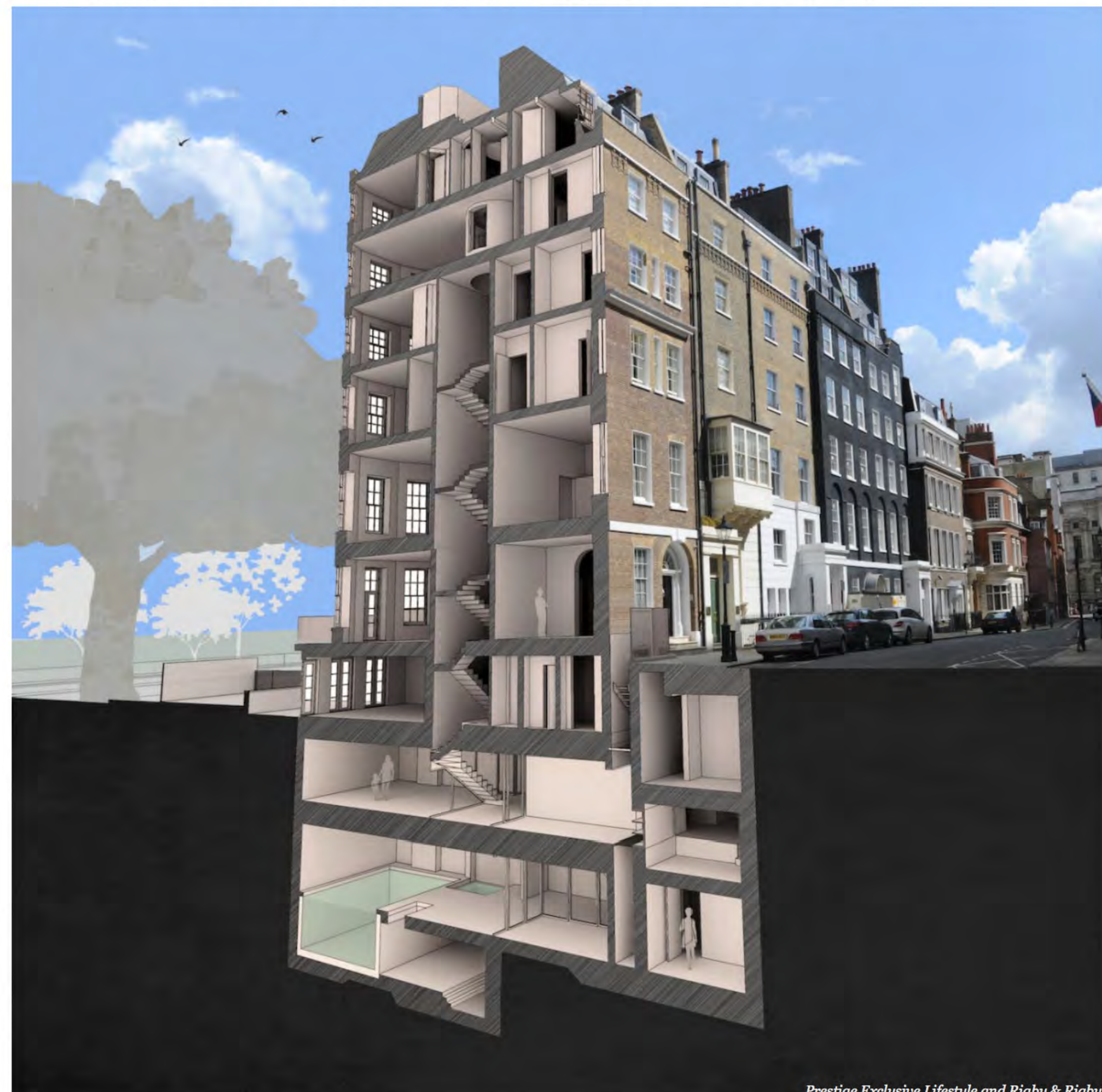
Prestige Exclusive Lifestyle and Rigby & Rigby

Architecturally, London's luxury basements are spectacular. They can double living space in a city where land is a rare and precious. This basement project, the brainchild of Prestige Exclusive Lifestyle with Rigby & Rigby, will transform the property.